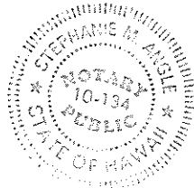
EXHIBIT "H" (Page 2 of 12)